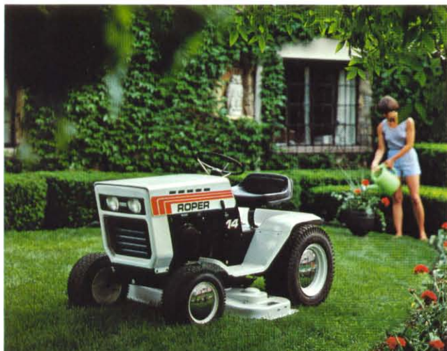
Shown With Optional Hub Caps, TA018AR.

Great going . . . easy handling. Tecumseh 14 hp engine with regulator and rectifier, solid state ignition system • 8-speed all-gear Roper 6 + 2 Pac power train transmission • separate throttle/choke • keystore • top fuel tank with visual level indicator • independent parking brake • combination clutch/brake • headlights • taillight.