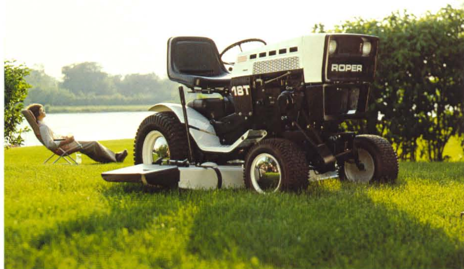
Shown With Optional Rotary Mower, TT738AR and Optional Hub Caps, TA018AR.

Power-packed and smooth with 18 hp opposed-piston, four cycle, twin cylinder Onan engine . . . 8-speed 6 + 2 Pac all-gear transmission • keyswitch electric start • running time monitor • deep-padded, high-back, spring-mounted and adjustable seat • rear-mounted fuel tank with fuel gauge • full fenders and footrests • combination clutch/brake • independent parking brake • twin sealed beam headlights • taillight.