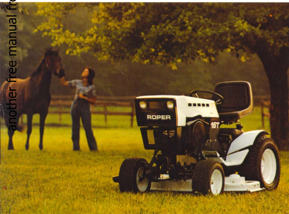
Shown With Optional Rotary Mower, TT728AR.

another free manual from www.searstractormanuals.com