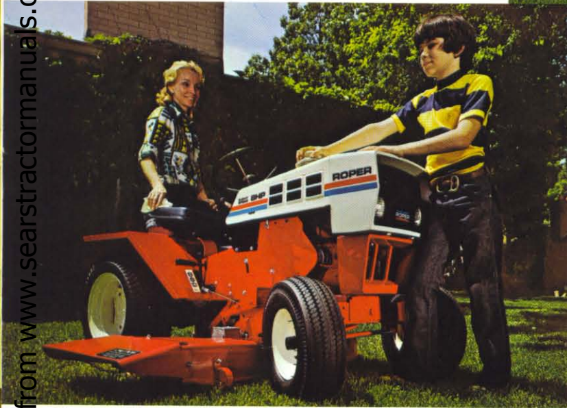
Shown With Optional Rotary Mower, TT2041R.

another free manual from www.seartractormanuals.com