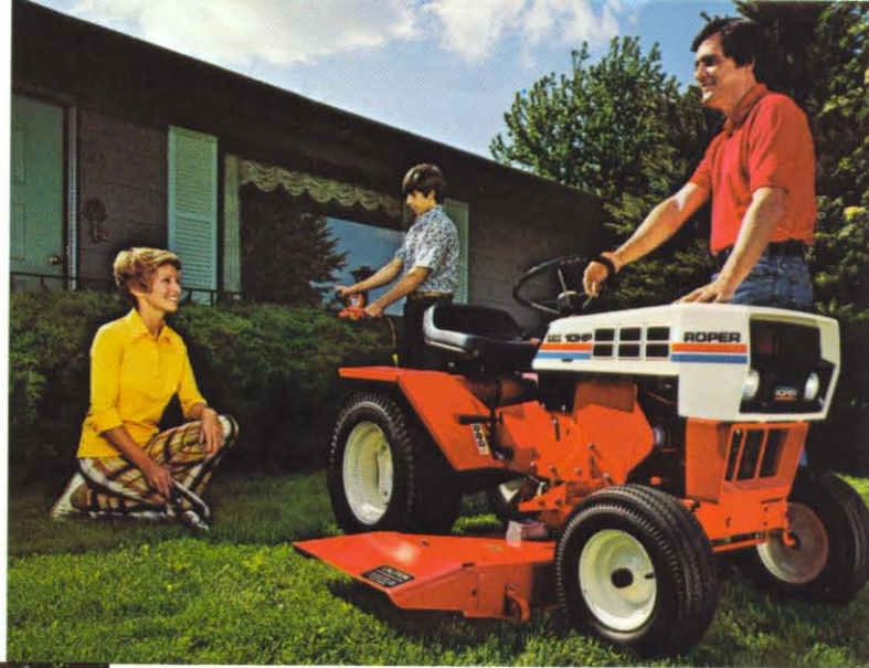
Shown With Optional Rotary Mower, TT2041R.

Big tractor performance with rugged 10 hp Tecumseh cast-iron engine with solid state ignition system. Roper 6 + 2 Pac all-gear transmission • rear-mounted fuel tank • sealed beam headlights • ball-joint steering • handles an 8-inch plow and all Roper tillage and snow removal attachments.