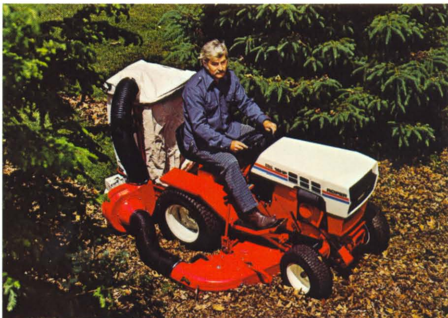
Shown With Optional Self-Powered Lawn Vacuum, TT6951R.

MODEL T32241R (not shown) Briggs & Stratton, Straight-13.