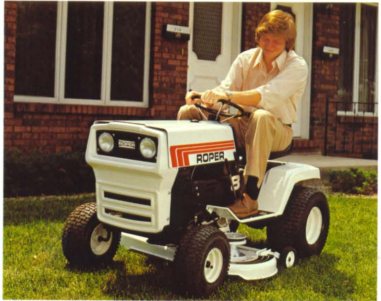
Rotary Mower Included With Tractor.

MODEL L06356R (not shown) — 10 horsepower cast-iron Tecumseh engine, four-speed transaxle, 36-inch dual blade mower.