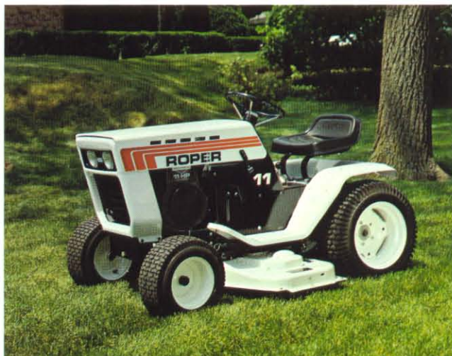
Both Shown With Optional Rotary Mower, TT718AR.

Four-cycle 11 hp Briggs & Stratton cast-iron Snychro-Balanced engine . . . provides plenty of power. Roper 6 + 2 Pac all-gear transmission with 6 speeds forward, 2 speeds in reverse • keystore • automotive-type ignition system • dual-spring, adjustable seat • top fuel tank • independent parking brake • throttle, choke combined • clutch/brake • taillight.